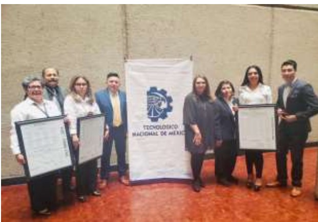
ISO 50001: 2011 Certificate Reception

A multi-site group with 16 Technological Institutes certified in ISO 50001:2011.